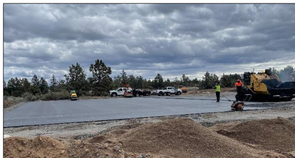
Paving begins on new courts (April 13, 2026).

Do consider running for the board. Each of you has new ideas and ways to uniquely support the Club. ❖